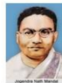
Jogendra Nath Mondal