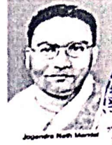
Jogendra Nath Mondal