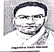
Jogendra Nath Mondal