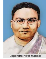
Jogendra Nath Mandal