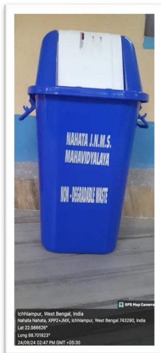
Plate 2: Non Degradable Waste Bin