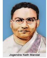
Jogendra Nath Mandal