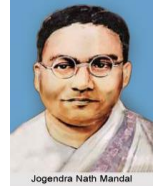
Jogendra Nath Mondal