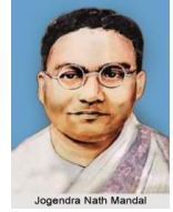
Jogendra Nath Mondal