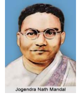
Jogendra Nath Mondal