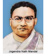
Jogendra Nath Mondal