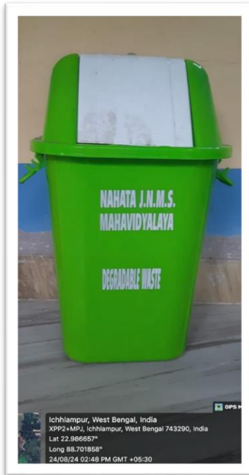
Plate 1: Degradable Waste Bin