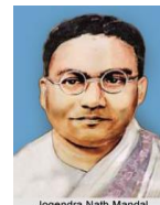
Jogendra Nath Mandal